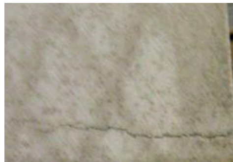
Figure C-10: Fissure