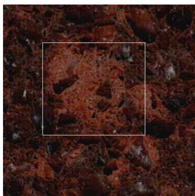
Figure C-8: Polychromatic blotch