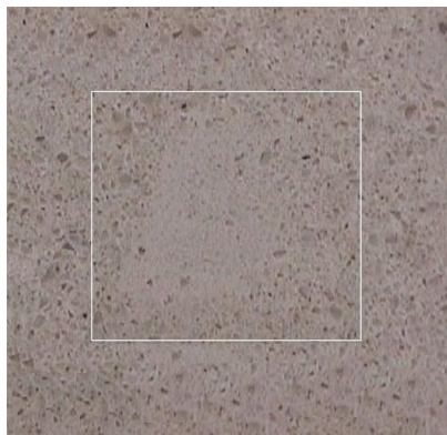
Figure C-7: Monochromatic Blotch