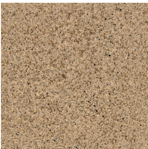
Figure C-2: Polychromatic