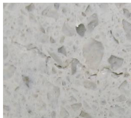
Figure C-11: Surface crack